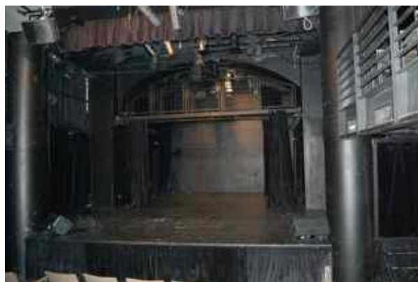
Stage showing gantry with curtains open

Well equipped, modern, black box theatre. With end on raked seating as well as a balcony. It is located not far from the fringe club and other spaces used by the fringe on the castle side of the river. The same building houses the Kavarna space.